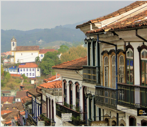
Ouro Preto / MG

Many small colonial towns are within a couple of hours' drive. Ouro Preto is a beautiful mining town that (along with nearby Mariana) is host to the annual winter arts festival, Festival de Inverno, in late July. The region of Serra do Cipo has many spectacular waterfalls, including the state's tallest near Tabuleiro. You can also check Santuário do Caraça which is full of adventures for its visitors, with trails to various locations, from waterfalls to caves and peaks