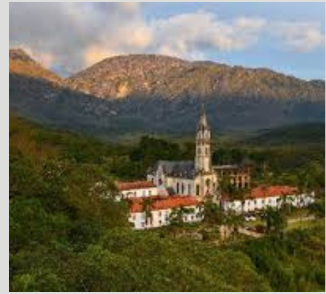
Santuário e Serra do Caraça