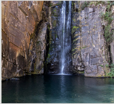
Cachoeira Véu da Noiva